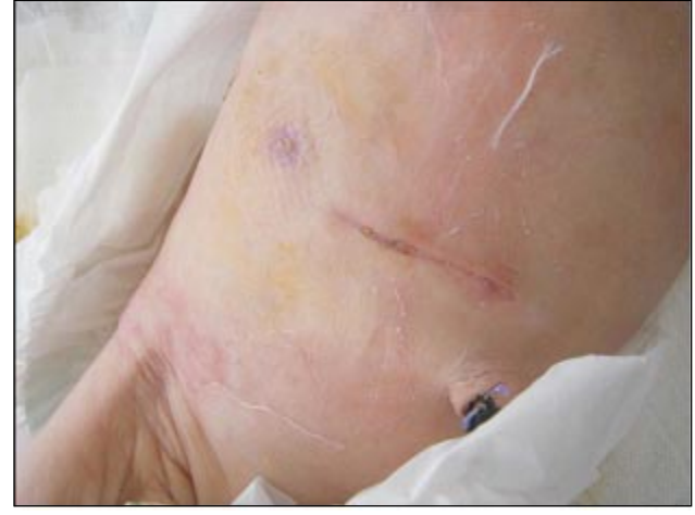
Fig.6 Three Weeks Later