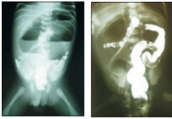
Fig.2 Air Fluid Levels Shown on Plain X ray & Barium Enema Disscusion

Jejunoileal atresia occurs in 1 of 2,500 live births owing to an intestinal vascular insult in utero and multiple intestinal atresias occur less frequently, affecting only one fifth of all infants with intestinal atresia (1). Puri et al (5) reported that all cases of hereditary multiple